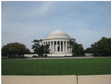
Jefferson Memorial, Washington D.C.