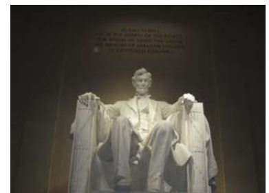
Lincoln Memorial, Washington D.C.

Voting ends at 4:00 PM School T-shirt and Jeans Day