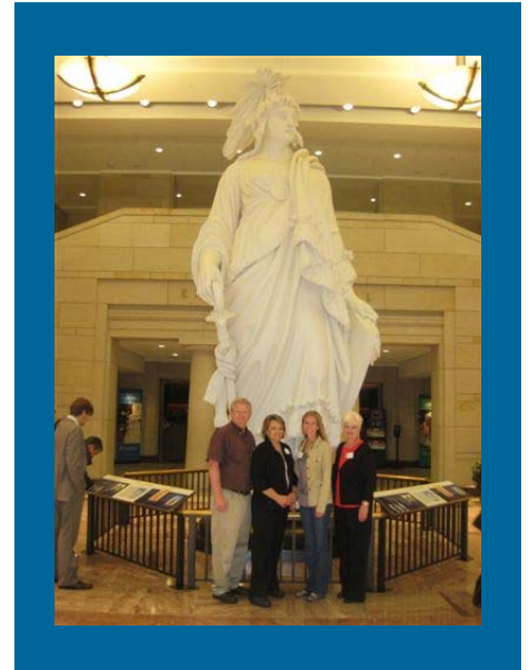
Freedom Academy representatives in front of Lady Freedom.